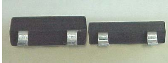
Figure 3. Comparison of Present and New Packages